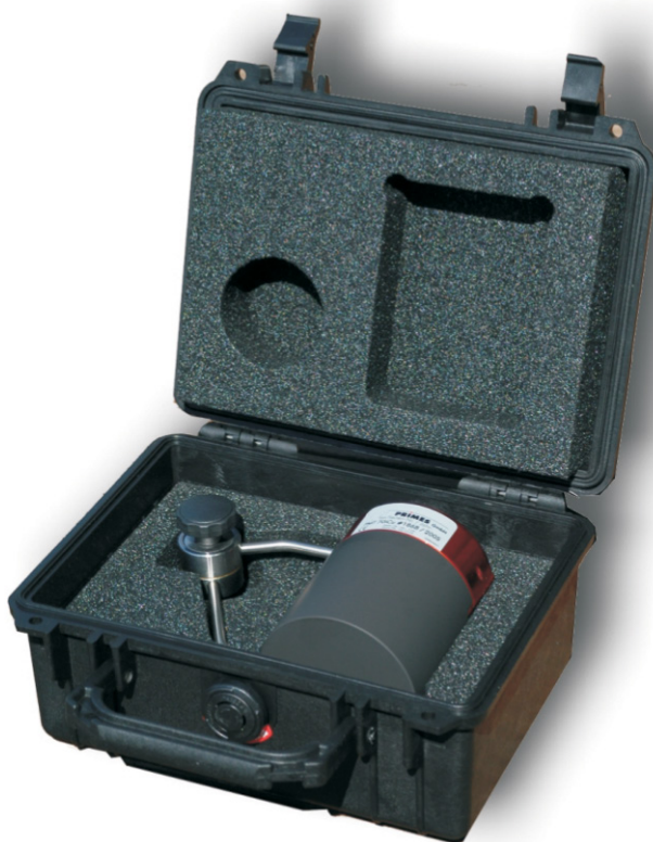
Transport box for the PMT

As all options are available for the entire absorber range, the PocketMonitor is a very flexible measuring device.