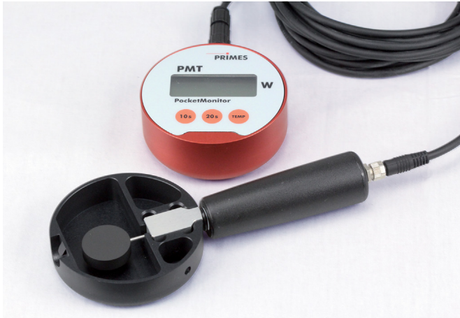
PMT 01p with separate absorber