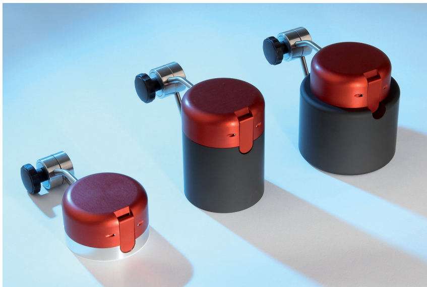
Left to right: PMT 05p, 70icu, 120icu

The PocketMonitor (PMT) is a mobile power measuring device which can be employed easily and was designed for the application in everyday production. The compact and robust design as well as the fast and simple application are key features.